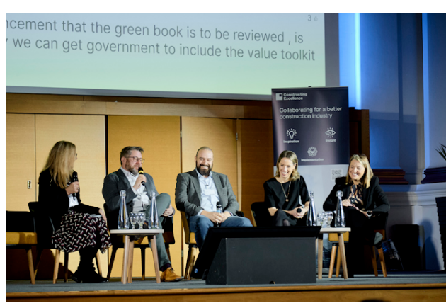
Better for the Planet