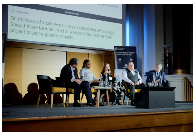
Showcasing Our Groups