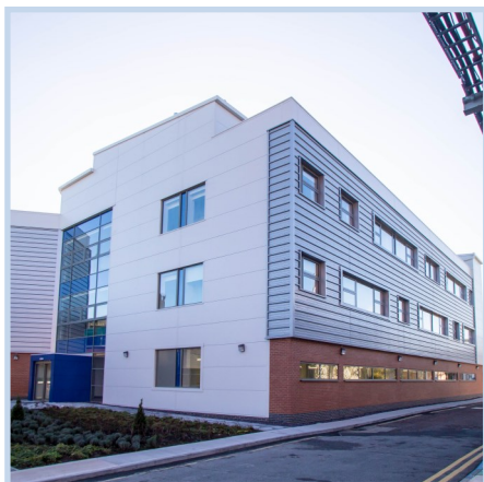
Catalyst Research Laboratory and Office Facility, Billingham, Tees Valley – National Winner of the Integration & Collaborative Working Award 2014

Visit: www.constructingexcellence.org.uk/regionsclubs.jsp