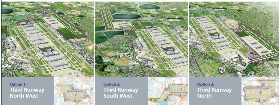
Option 1: Third Runway North West

Heathrow's options for connecting the UK to growth