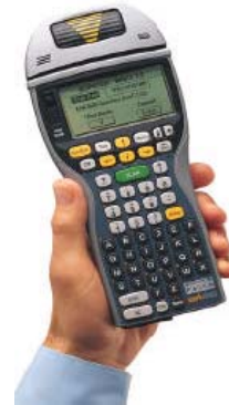
Portable bar-code reader