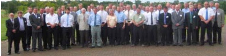
Interserve Project Services – West Midland's Supply Chain Workshop