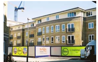
Block B of Denne's Ordell Road scheme nearing completion